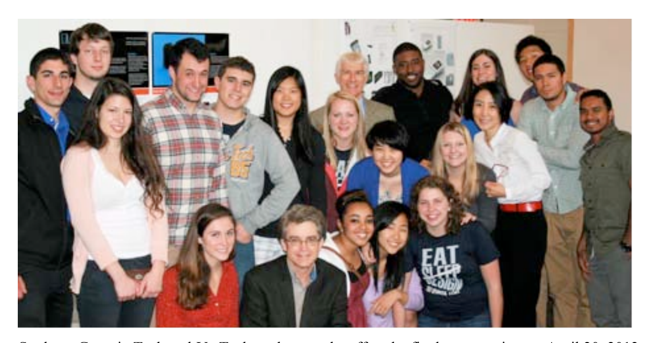
Students Georgia Tech and Va Tech students and staff at the final presentation on April 20, 2012

"You're a junior designer(s) for a wireless manufacturer. At this year's Consumer Electronics Show, some of your company's marketing staff met consumer researchers from the Wireless RERC. RERC staff shared their research findings showing the large number of people with disabilities among current wireless customers. These findings also showed the large potential market of people with disabilities who aren't yet wireless customers. The marketing staff has prepared several profiles ("personas") of these customers and has asked your manager to review products from the company's line and determine what features would have to be added or changed in order to attract these personas as new customers - and to keep those with disabilities who are already among the company's customers."